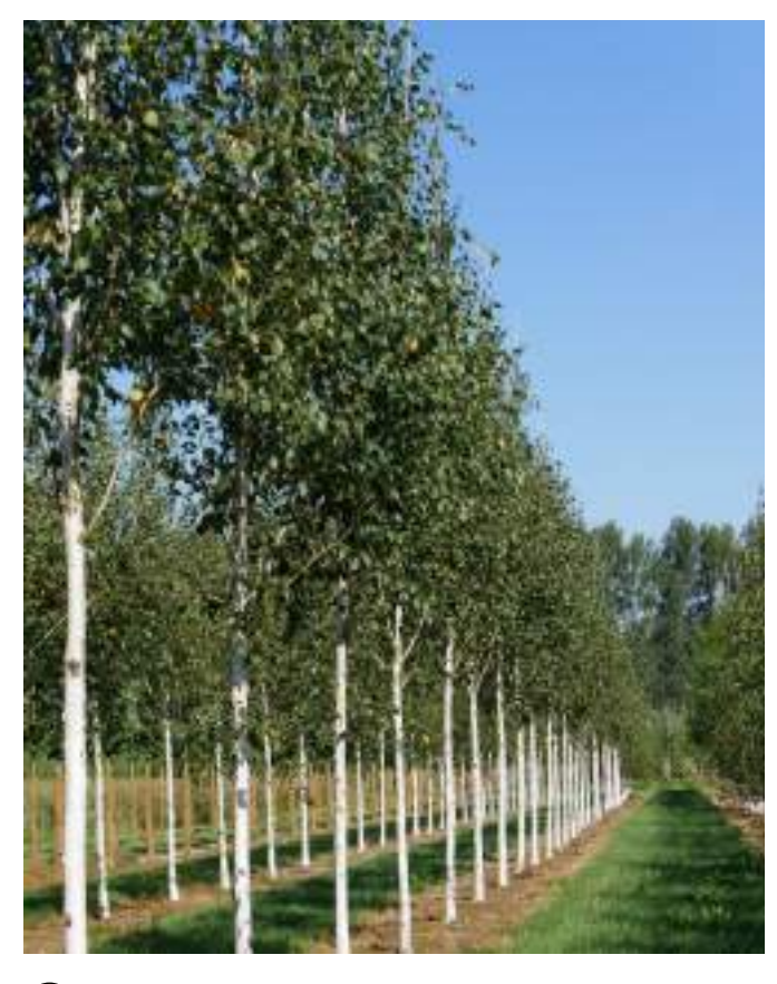
Betula jaquemontii (clearstem)